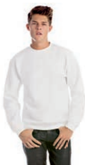
B&C ID.002 P.12