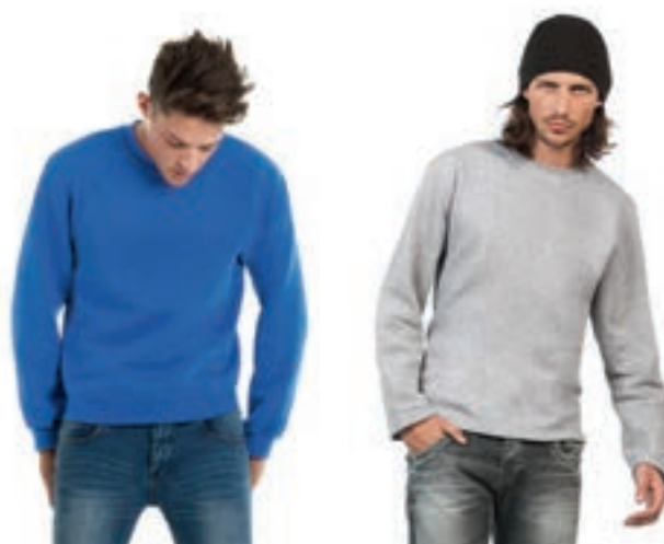
B&C SET IN P.8