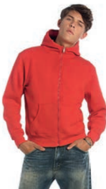
B&C MONSTER /MEN P.10