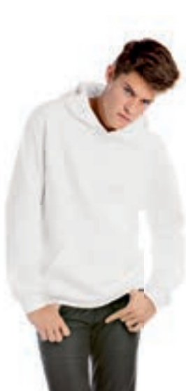
B&C ID.003 P.12