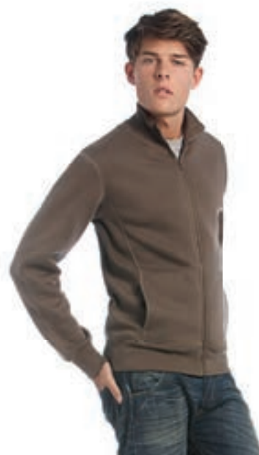
B&C SPIDER /MEN P.11