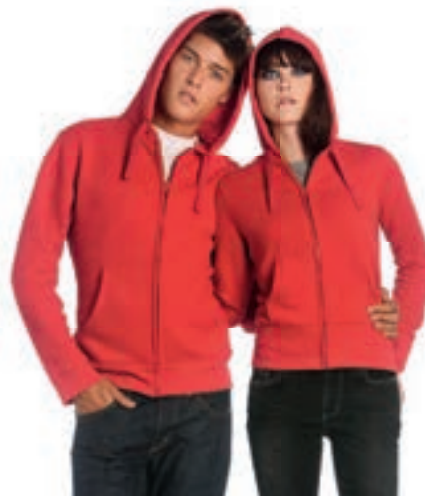
B&C HOODED FULL ZIP /MEN & /WOMEN P.6