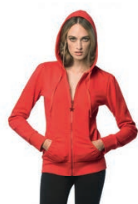
B&C WONDER /WOMEN P.10