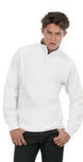
B&C ID.004 P.13