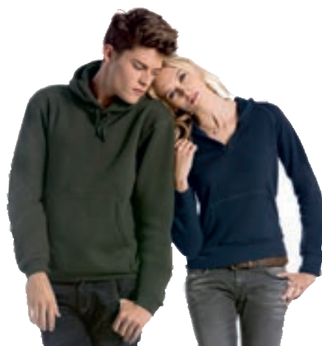
B&C HOODED, B&C CAT /WOMEN P.7